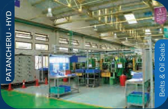
PATANCHERU - HYD