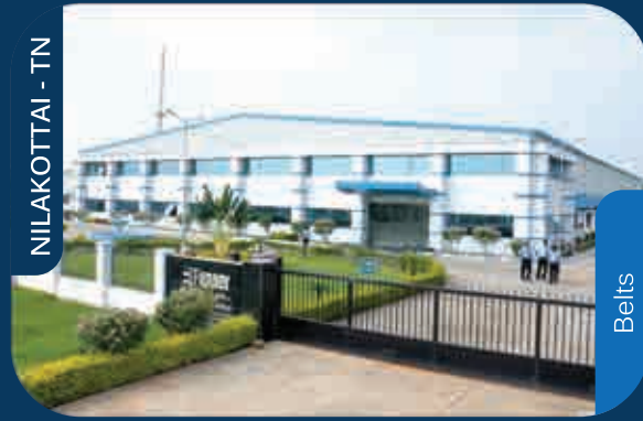
NILAKOTTAI - TN