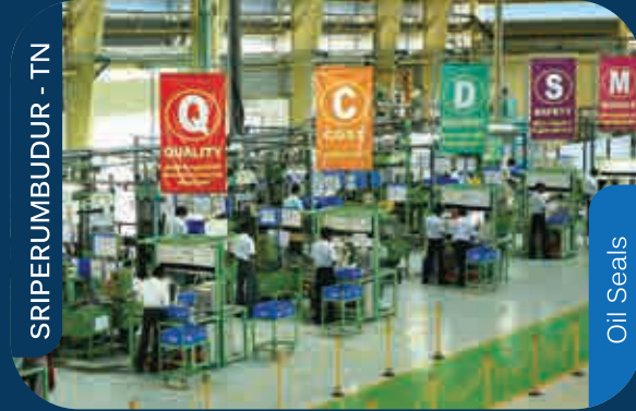
SRIPERUMBUDUR - TN