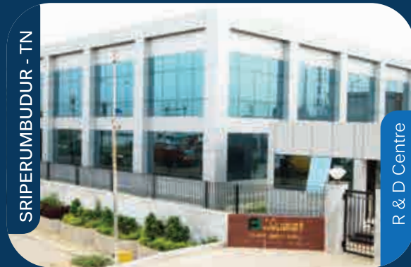
SRIPERUMBUDUR - TN