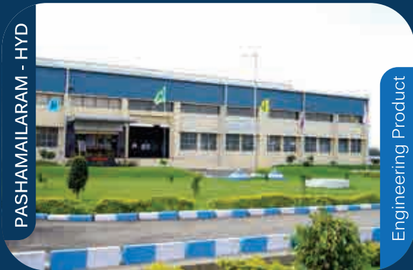
PASHAMAILARAM - HYD