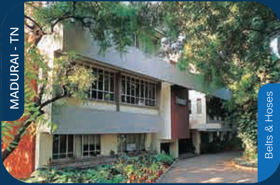
MADURAI - TN